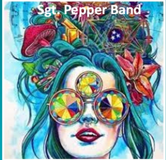
The Sgt. Pepper band was created to perform in a new play being performed by the Dhahran Theatre Group the first week of November, 2021.

Beatles songs form part of the performance: Yesterday, Here Comes the Sun, Ob-La-Di, Ob-La-Da, All you need is Love, and With a Little Help from My Friends.